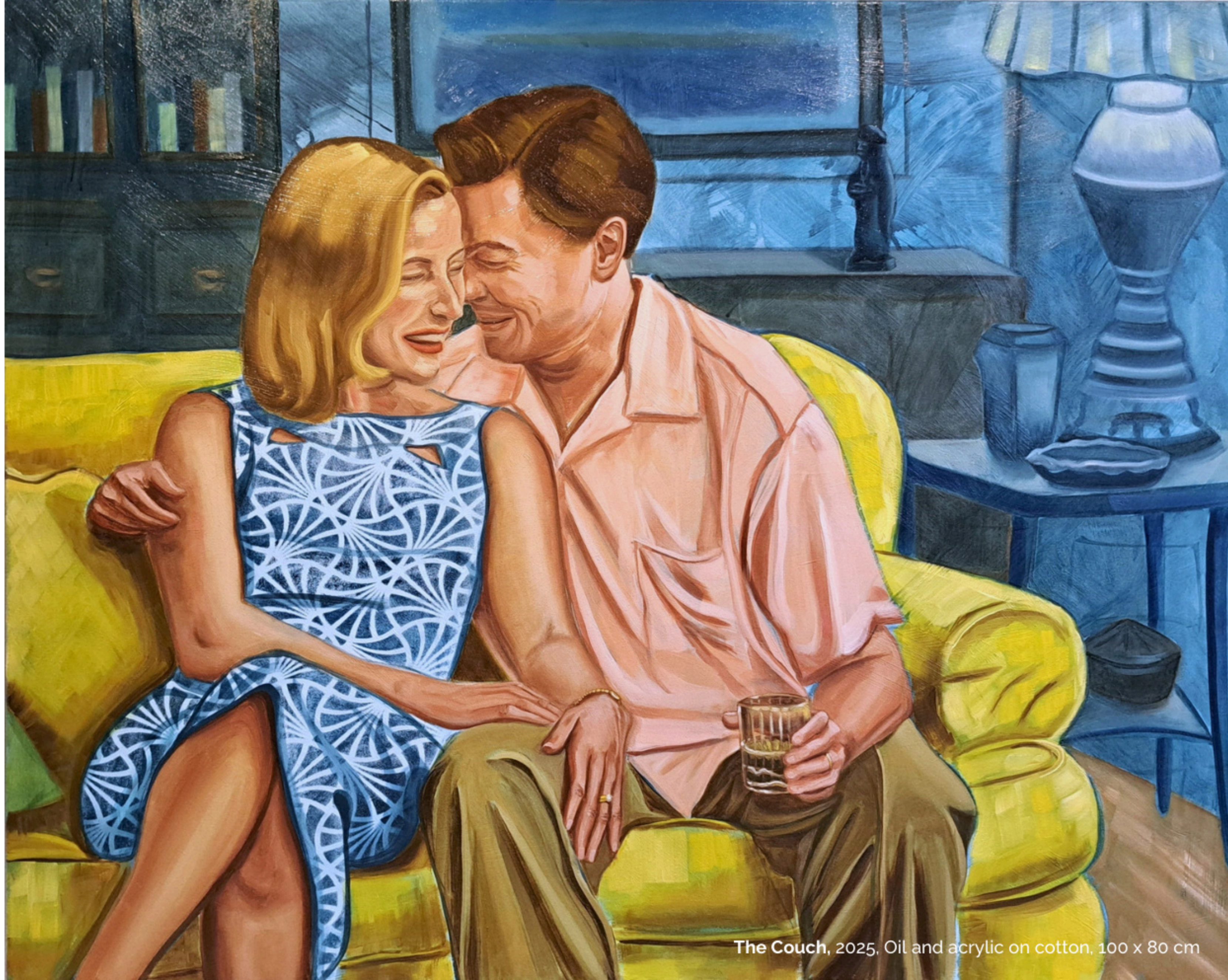
The Couch, 2025. Oil and acrylic on cotton, 100 x 80 cm