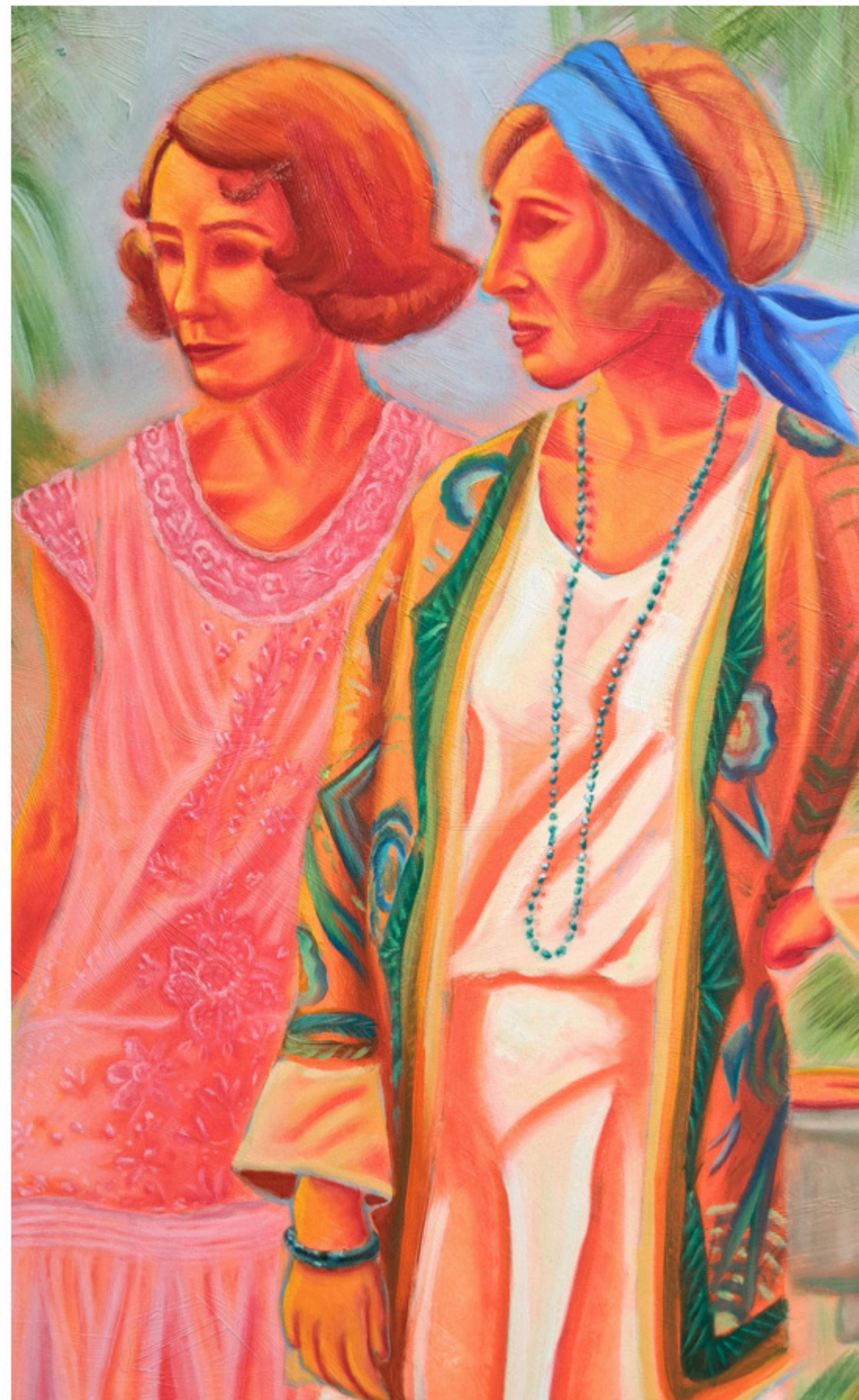
Glamazones , 2025, Oil and acrylic on cotton, 90 x 90 cm