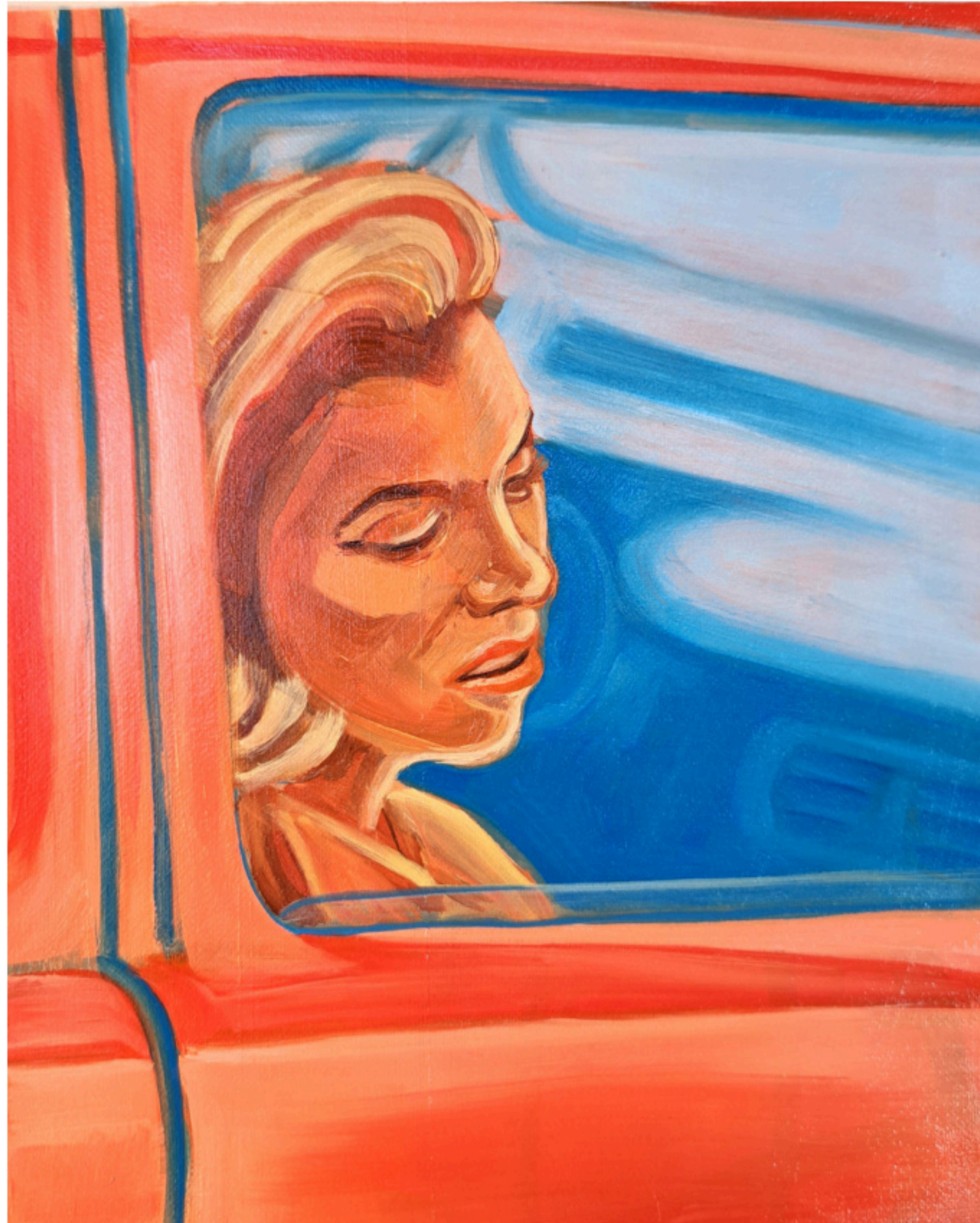
Desperation, 2025 Oil and acrylic on paper 21 x 29 cm