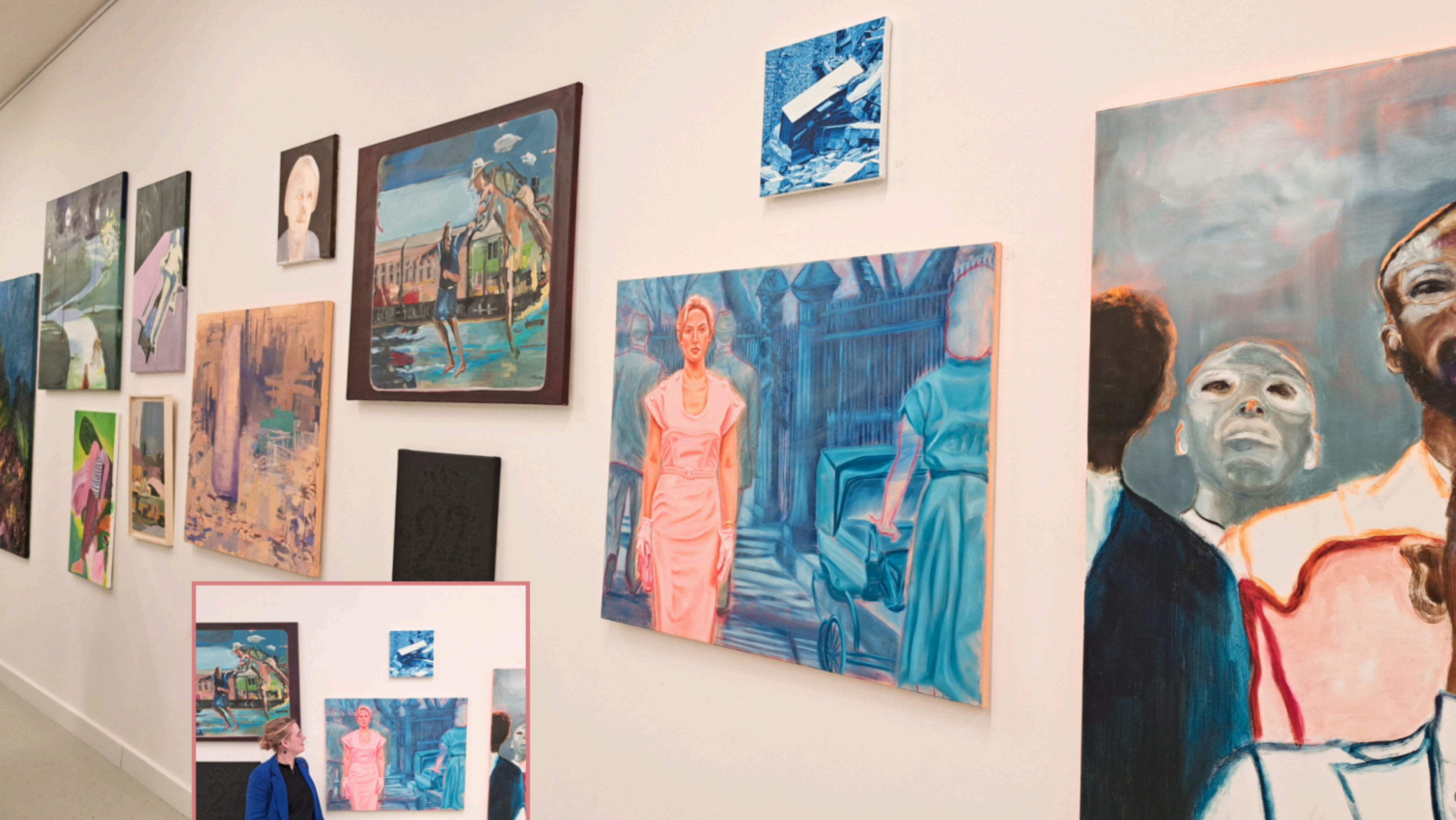
De Kunstwedstrijd, 2025, CC Zwaneberg

This work was selected by the jury of "De Kunstwedstrijd", a painting competition of cultural center CC Zwaneberg in Heist-op-den-berg.