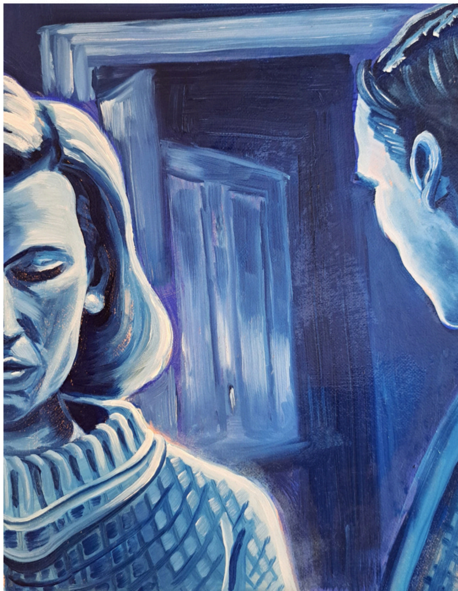
Domestic Dispute, 2025 Oil and acrylic on paper 21 x 29 cm