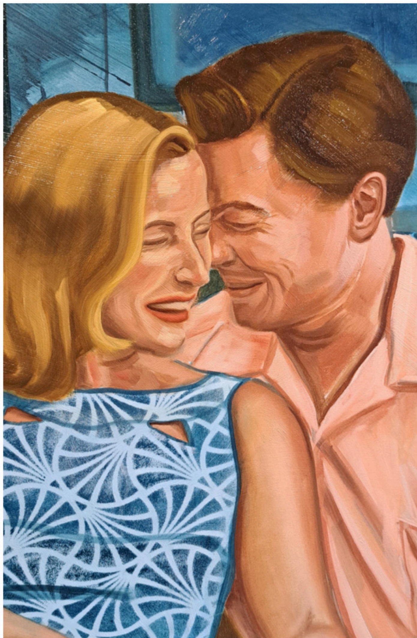
The Couch , 2025, Oil and acrylic on cotton, 100 x 80 cm