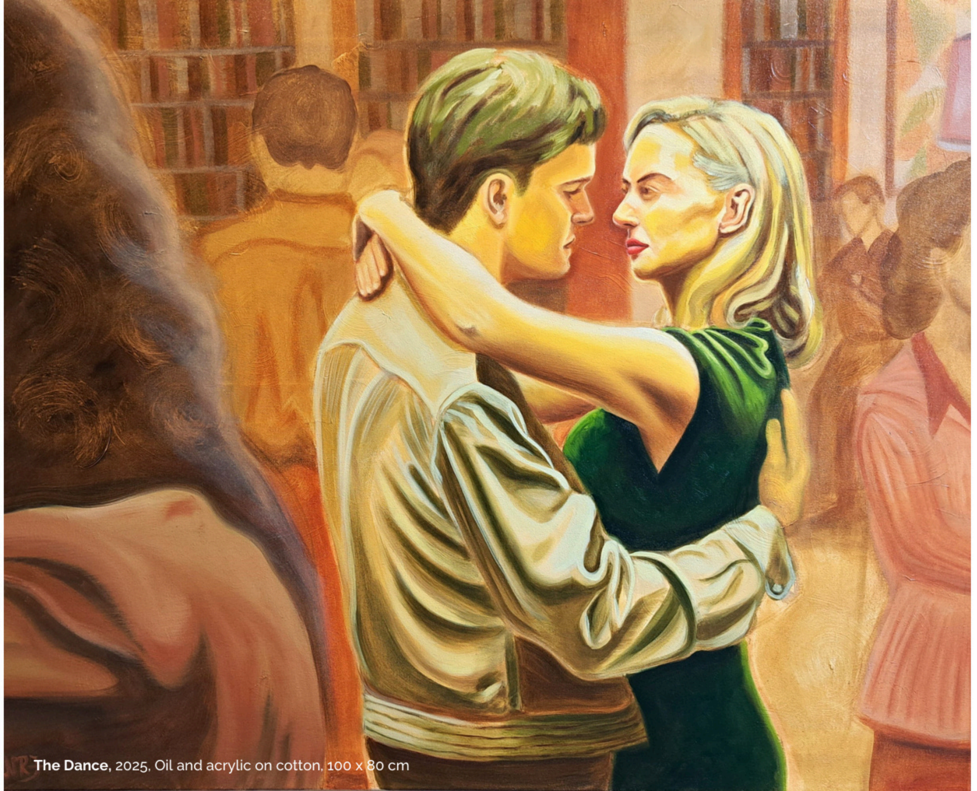
NRB The Dance, 2025, Oil and acrylic on cotton, 100 x 80 cm